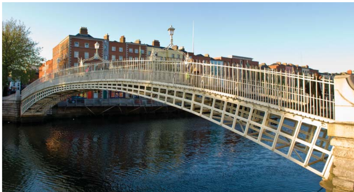
Dublin's Ha'Penny Bridge earned its nickname from the half-penny toll once charged to cross the river.

Number of overnight stays in parentheses. This tour may also be reversed.