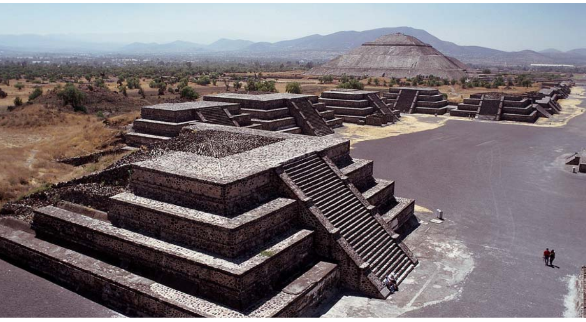
Teotihuacán-the Aztec name meaning "birthplace of the gods"-once flourished as a religious center.

Frida Kahlo Museum and Coyoacan Ballet Folklórico