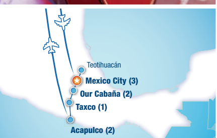
Number of overnight stays in parentheses. This tour may also be reversed.