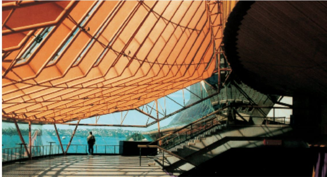
Enjoy stunning views of the Sydney Harbour from the lobby of the world-famous Sydney Opera House.