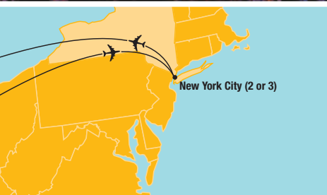
Number of overnight stays in parentheses. This tour may also be reversed.