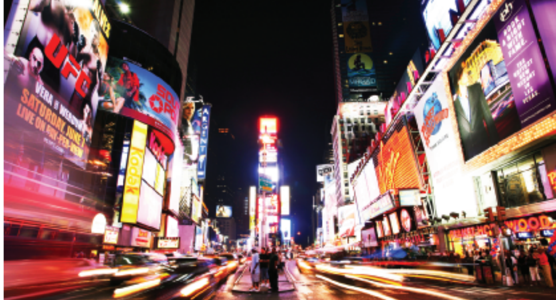
Stand in the heart of New York City's Times Square, where billboards illuminate the night sky in spectacular style.